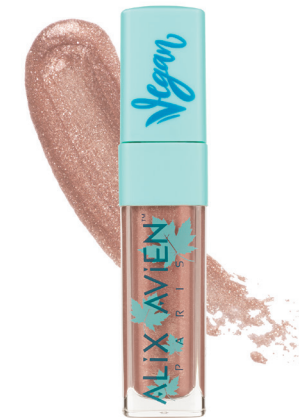
08 - BABE NUDE