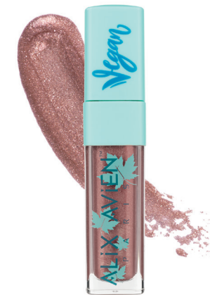
10 - SWEET CARAMEL