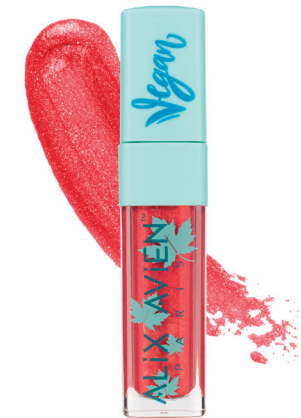
09 - STRAWBERRY