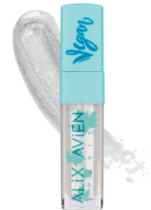
11 - DIAMOND