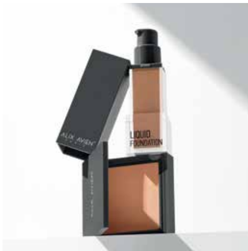
FACE 214 SKU