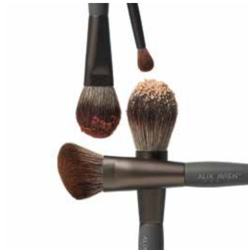
ACCESSORIES 22 SKU