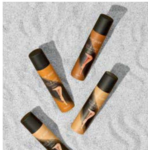
BODY 7 SKU