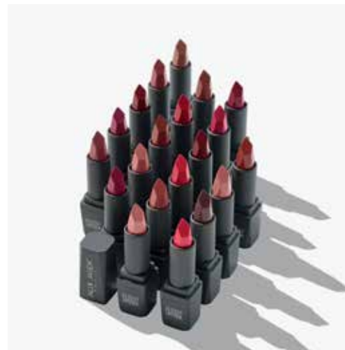
LIPS 207 SKU