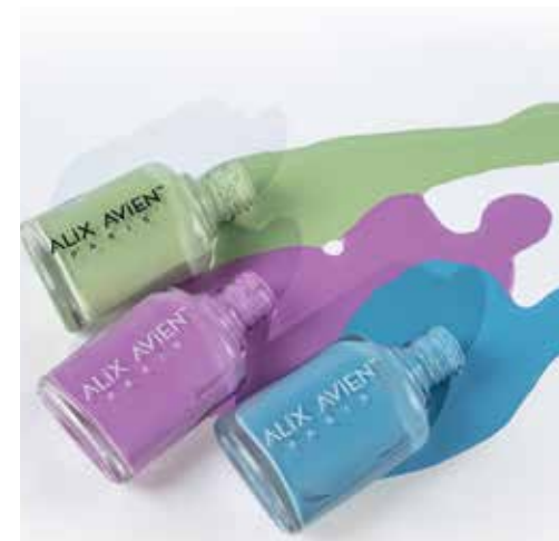
NAILS 226 SKU