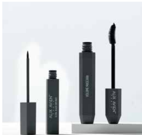
EYES 87 SKU