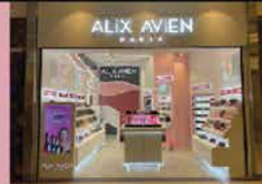
MALL OF ISTANBUL