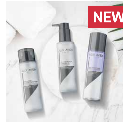
CLEANSING 4 SKU